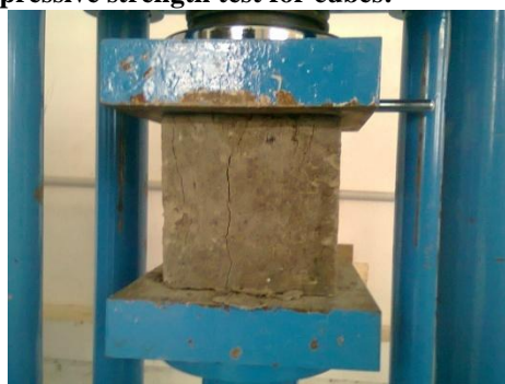
Figure 3a Testing of concrete cube specimen for compressive strength