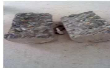
Figure 5 Failure mode of specimen in split tensile strength