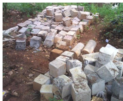
Figure 3b Failure mode of cube specimen in compressive strength