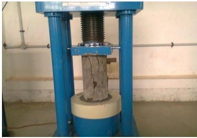
Figure 4a Testing of concrete cylinder specimen for compressive strength