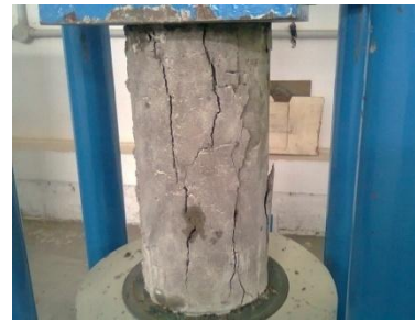
Figure 4b Failure mode of cylinder specimen in compressive strength